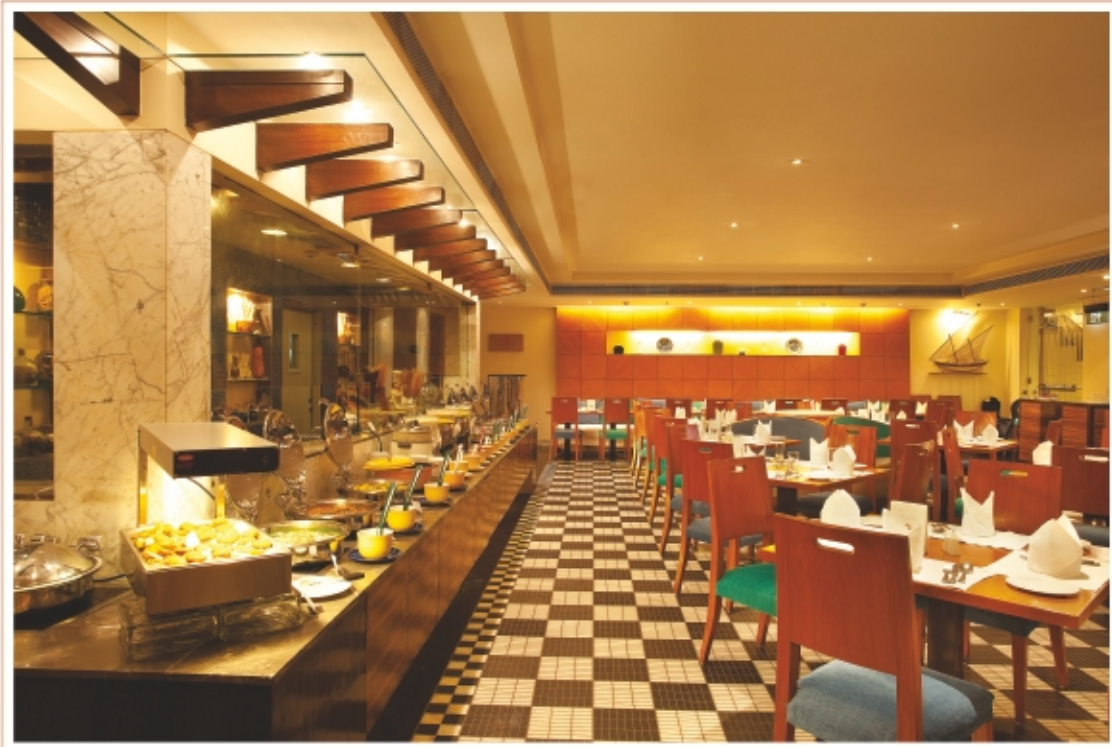
Welcomcafe Cambay 24x7 Fine Dining restaurant