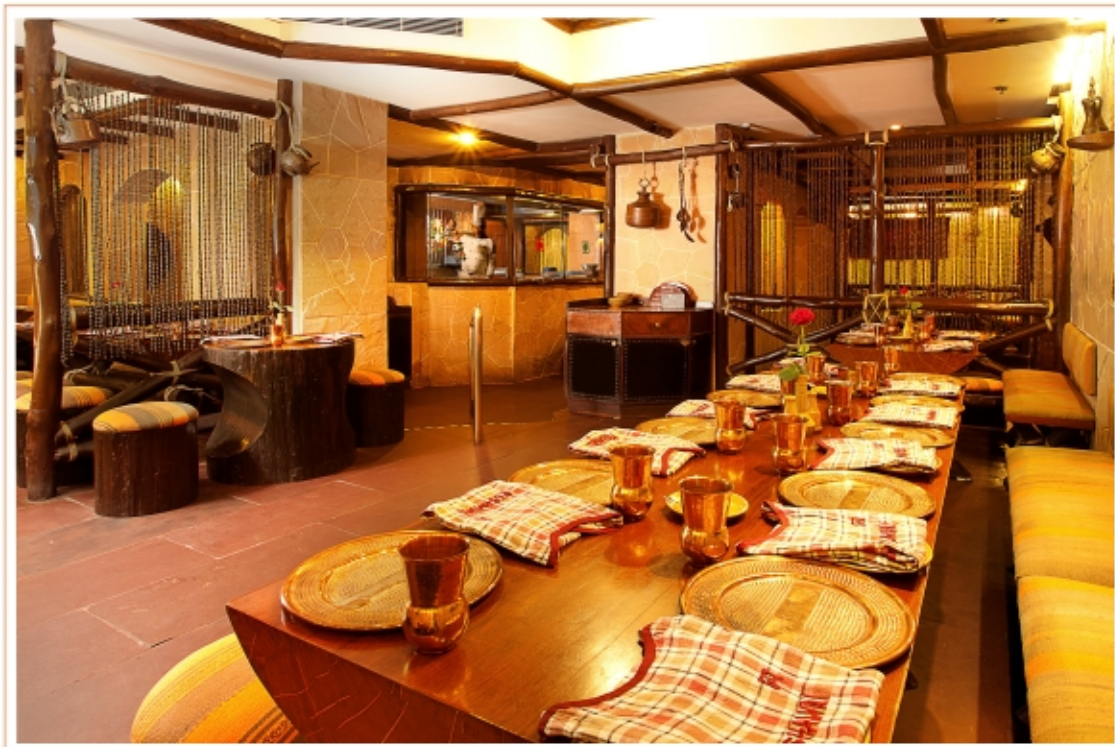
Peshawri - Speciality restaurant offering North-West Frontier cuisine