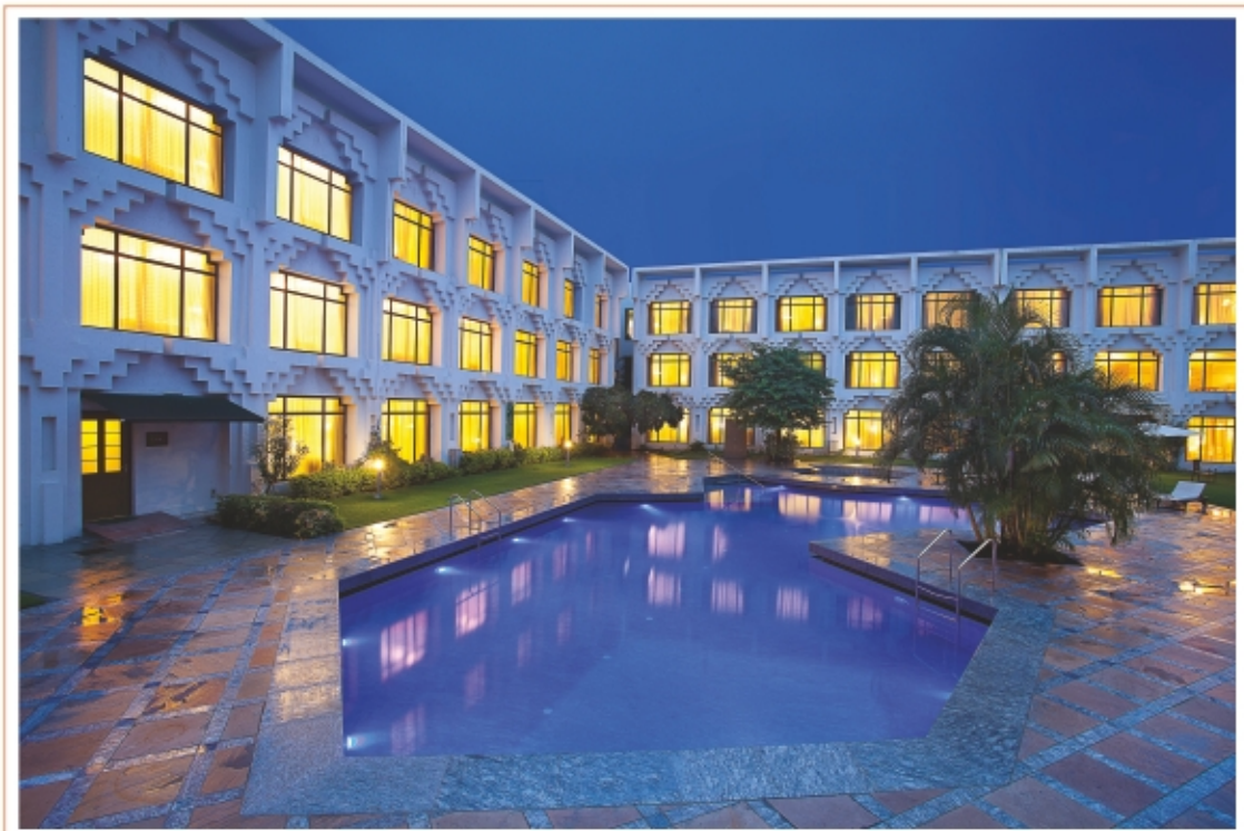
Pool Side View