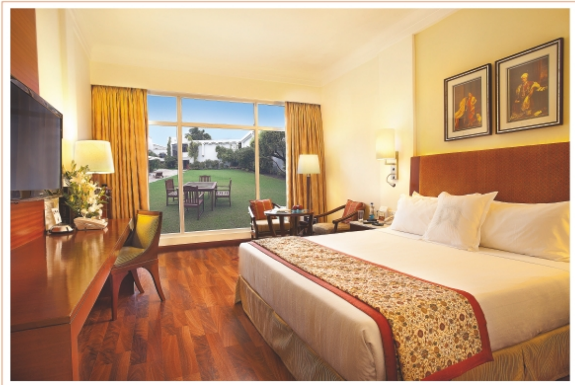
Executive Club Exclusive room